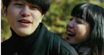
©What Meiling Decided 2019

Meiling is a college student who has dual Japanese and Chinese citizenship. She spends her winter break with her Japanese boyfriend Sho. She has to choose her nationality before she reaches her 22nd birthday.