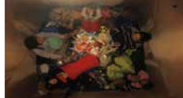
©What Meiling Decided 2019

Ami lives with her grandfather and attends an art school. She's not doing well at school and the pressure is mounting to secure a job after she graduates. She gets more frustrated as her grandfather begins to suffer from Alzheimer's. But when she hears him talk about his past, her mindset begins to change.